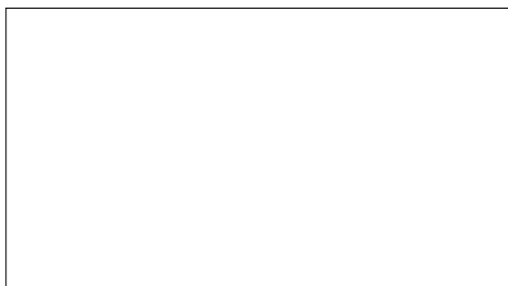
Figure 1 Figure caption

If figures are inserted into the main text, type figure captions below the figure. In addition, submit each figure individually as a separate file. Figures should be provided in a file format and resolution suitable for reproduction, e.g., EPS, JPEG or TIFF formats, without retouching. Photographs, charts and diagrams should be referred to as "Figure(s)" and should be numbered consecutively in the order to which they are referred