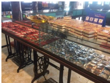
Figure 7 Crystal beads, amulets, and souvenirs related to the Naga belief in Ruenjompetch Museum