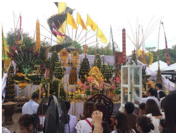
Figure 5 The atmosphere of the annual worship ceremony taking place at Poo Phayanak shrine

It can be said that the worship ceremony of Ong Poo Phayanak and Ong Ya Naknoi is a sign that is important to government agencies and people living near the Mekong River because the ceremony is performed grandly every year, from generation to generation. The ceremony means to worship and invite Phaya Anantanakarat, the Naga families, guardian spirits, the Naga, and the Nagi to the shrine to receive tributes and offerings. The ceremony is also organized to ask for forgiveness from them and Mother River (Mekong River). For connotative meaning, people attending the ceremony wish to receive protection, blessings, happiness, and success from the Nagas. Some locals define the ceremony as a way to make them healthy, wealthy, and lucky as stated in the interview: