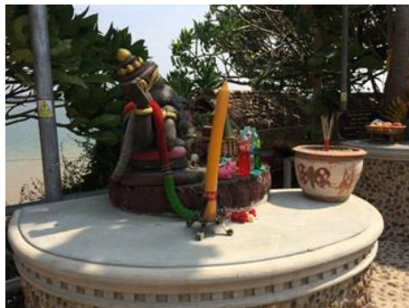
Figure 6 The sculpture of Ganesh is also placed near the shrine for people to worship.

5) Souvenirs related to the Nagas Ruenjompetch Museum are located south of Poo Phayanak shrine near the 2 nd Thai-Lao Friendship Bridge. In 2016, an entrepreneur built a Thai-style house as he believed the location of the house is the gate for the Nagas to travel to the human world. He often encountered strange incidents to confirm his belief, for instance, a serpent-like track was found on the basement wall during the construction, and a few marks were seen on the land under the bridge near the Mekong River. When locals heard about them, they believed the marks were made by the Nagas. A large crowd gathered to light incense sticks and ask for good fortune as stated in the interview with the museum owner: