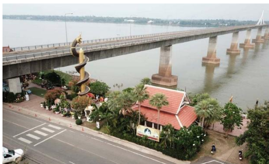
Figure 2 Poo Phayanak shrine at the 2 nd Thai-Lao Friendship Bridge was built due to the beliefs of people in the community.

under the 2 nd Thai-Lao Friendship Bridge to offer a new place for the Nagas, instead of the cave in the Mekong River, where the bridge was being built. However, both the medium and locals considered the Naga as, for literal meaning, a powerful creature that can cause fear to humans. A meaning hidden under the construction of the shrine is that the act of asking for forgiveness from the Naga was performed to relieve the Naga's anger to completing the construction in 2010.