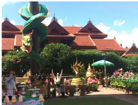
Figure 4 The sculpture of Phaya Srisutto, who in the legend is believed to connect to Wang Nakin Khamchanot in Udon Thani Province, is located in front of Poo Phayanak shrine at the 2 nd Thai-Lao Friendship Bridge.