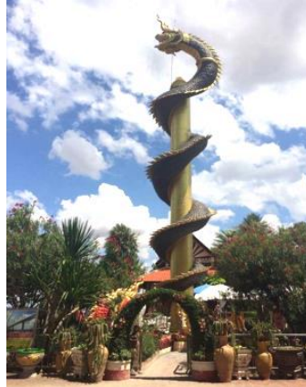
Figure 3 The sculpture of Phaya Anantanakarat was built for people to come to pay respect at Poo Phayanak shrine at the 2 nd Thai-Lao Friendship Bridge